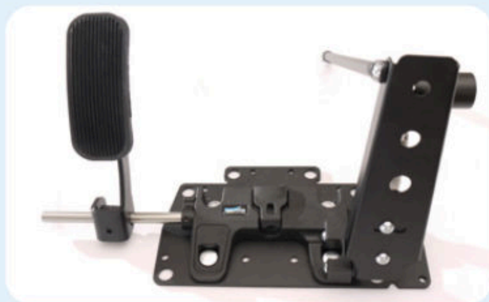
Left Foot Accelerator unit attached to the base plate